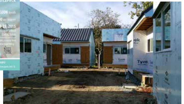
Cottages at Hickory Crossing